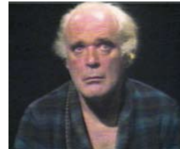
Patrick Magee in Samuel Beckett's EH JOE!

Since 1948 the BUFVC has actively promoted the use of moving image and sound in UK education. It provides specialist consultancy services to support the provision of moving image and sound in education. Drawing upon specialist practitioners within the Council's membership, we provide assistance in fields including: